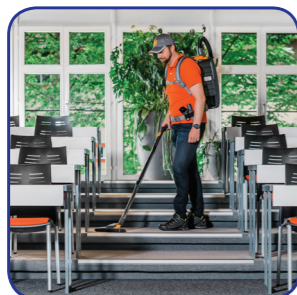
Congested areas such as classrooms