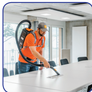
Office flow/spot cleaning