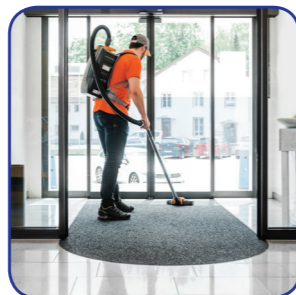
Cinema and opera